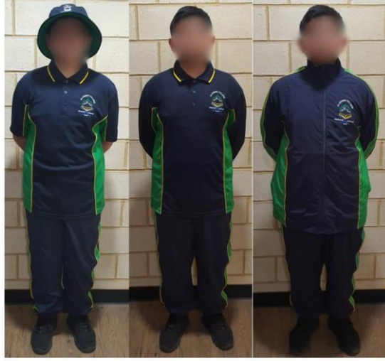
Summer Sports Uniform (short sleeve)