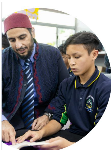
Planning your success together

Al-Ameen College was established in 2004 to provide a high-quality secular and religious education in an Islamic environment, thus enabling students to succeed in a constantly changing world. Al-Ameen College is governed by an Independent Board of Governors who are committed to providing educational facilities to all Australian Muslims in order to enable Muslim children to gain the highest level of secular and religious education within an Islamic environment so as to equip them with knowledge and values to take their rightful place as productive and respectful citizens of the Australian society.