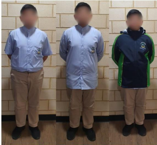
School Uniform (short sleeve)