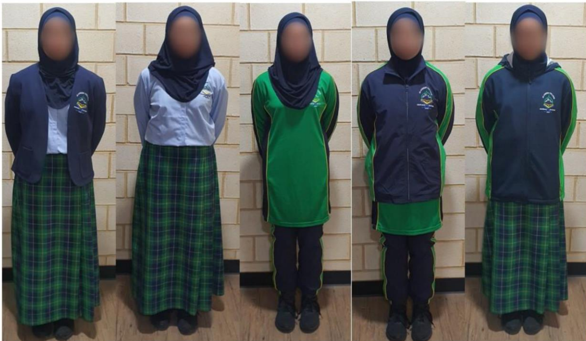
School Uniform Blazer (Compulsory for females)