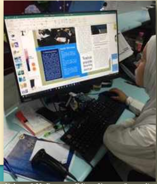
Volume 1 Ms Don — Editor: Natasya Suwandi

having a baby boy to continue their family Infanticide was formerly most-favoured form of gendercide, where girls particularly in Asia were immediately murdered, suffocated, and smothered in the wake of their birth. As technologies advanced, women have moved to foeticide where they implement a sex determination test to immediately abort the fetus if their gender was discovered contrary to the one in mind. In most cases, there is a mutual agreement between the husband and wife to commit gendercide, however, in some cases the mother's rights are also contravened as they are forced to abort, murder, or abandon their daughters. All because of their GENDER! Something that they are being coerced to do without a choice.