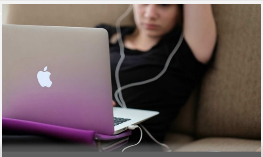
PHOTO: <u>Teenagers may not make the decision they know is right if</u> <u>they're pressured, stressed or seeking approval from mates.</u>

<u>Research has shown</u> youth aged 12 to 17 years are significantly less psychosocially mature than those aged 18 to 23