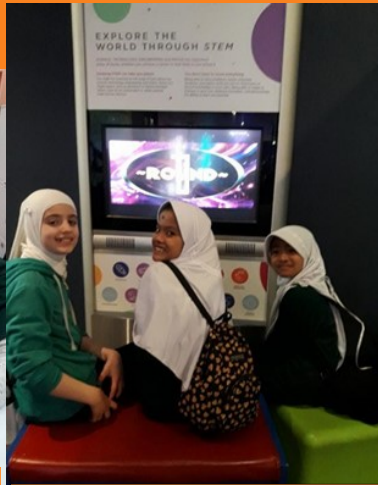
Designing earthquake-proof buildings at Scitech