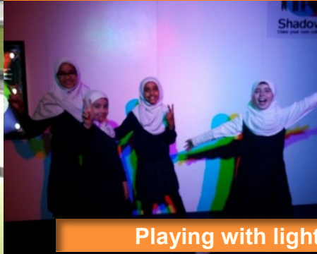
Playing with lights exhibition at Scitech