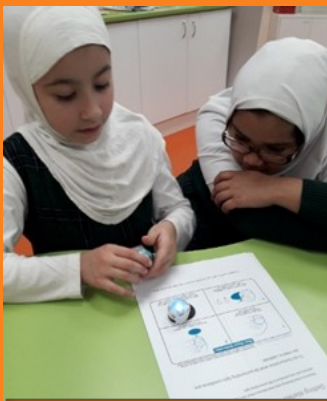
Programming using Ozobot at Scitech