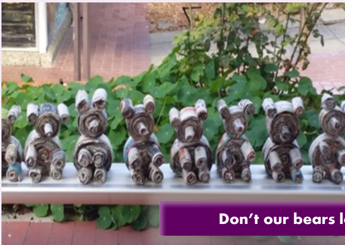
Don't our bears look fantastic!