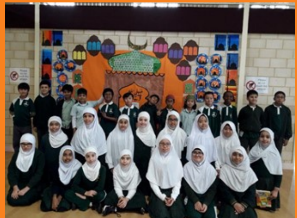
Proudly presenting the Ramadan display