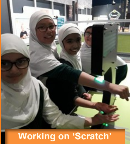
Working on 'Scratch'