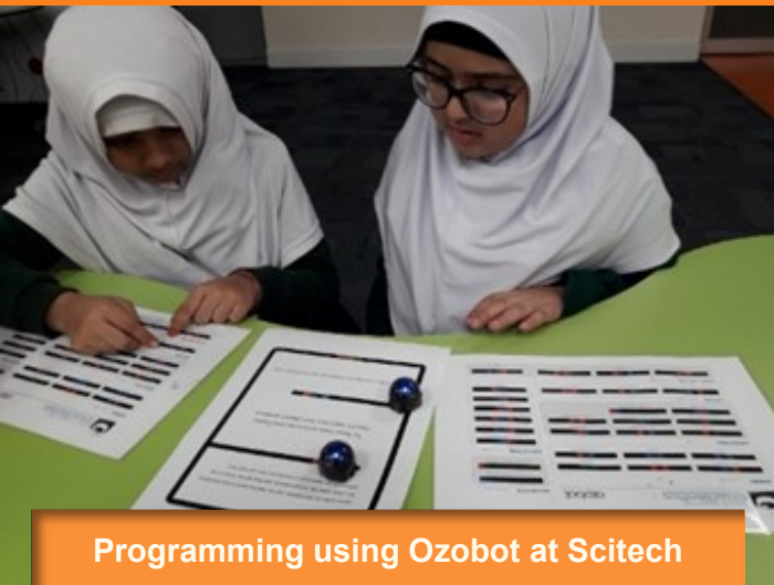
Programming using Ozobot at Scitech