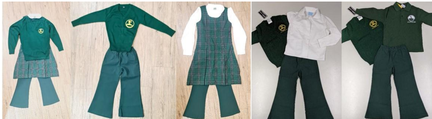
White shirt under Pinafore Dress with Green Pants and Sweater