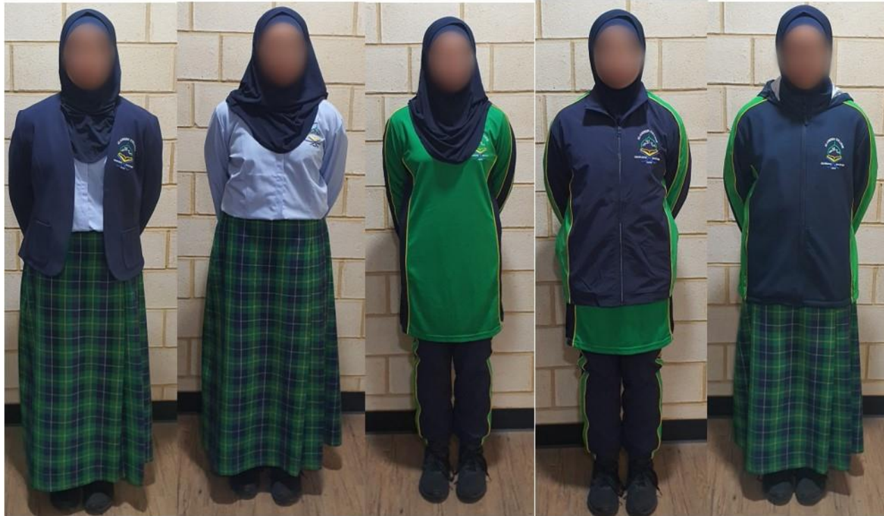
School Uniform Blazer (Compulsory for females)