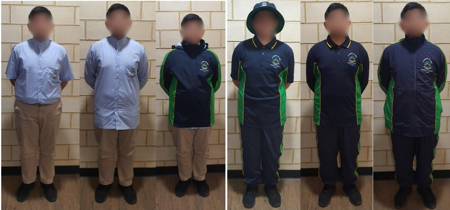
School Uniform (short sleeve)