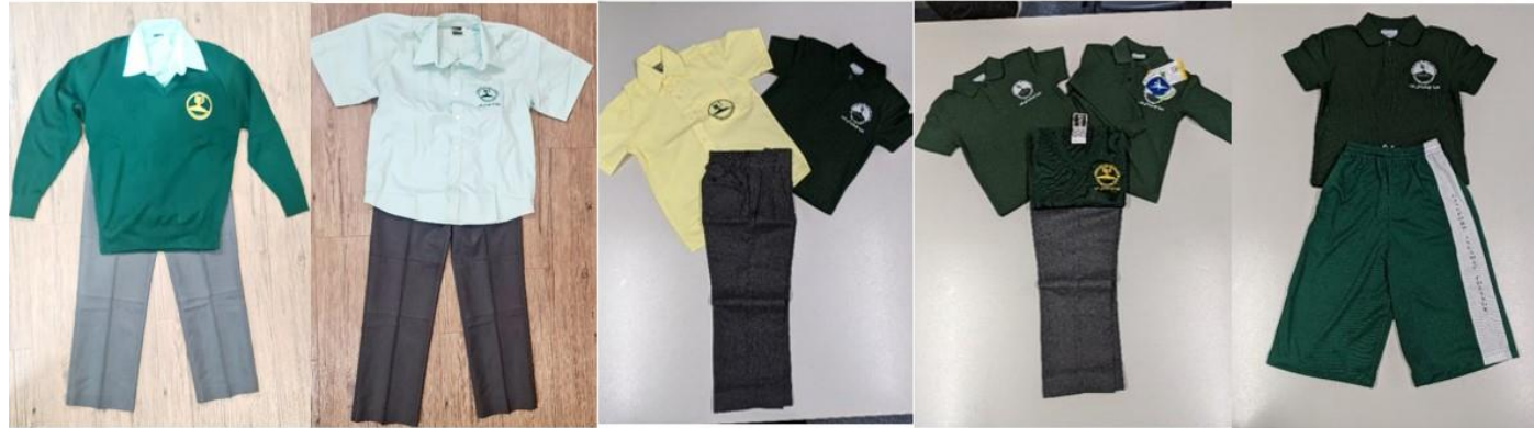
Light Green Shirt with Grey Pants and Green Sweater