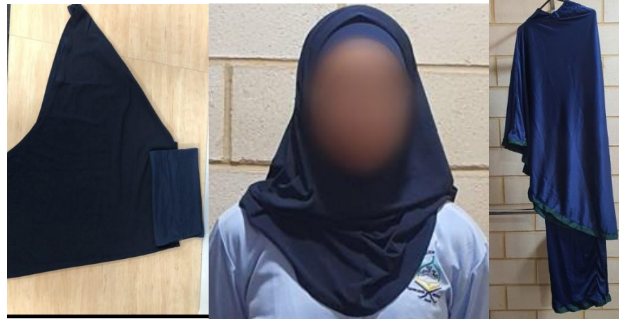
Two-piece Navy Hijab (Primary and High School)