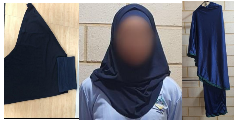
Two-piece Navy Hijab (Primary and High School)